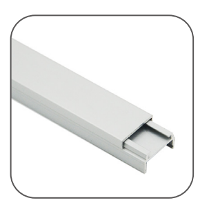
Alu Profile (Back)